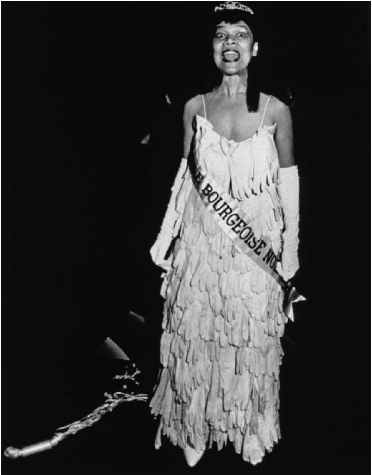
Untitled (Mlle Bourgeoise Noire shouts out her poem), 1980-83/2009 Lorraine O'Grady gelatine print, 40 cm x 50 cm