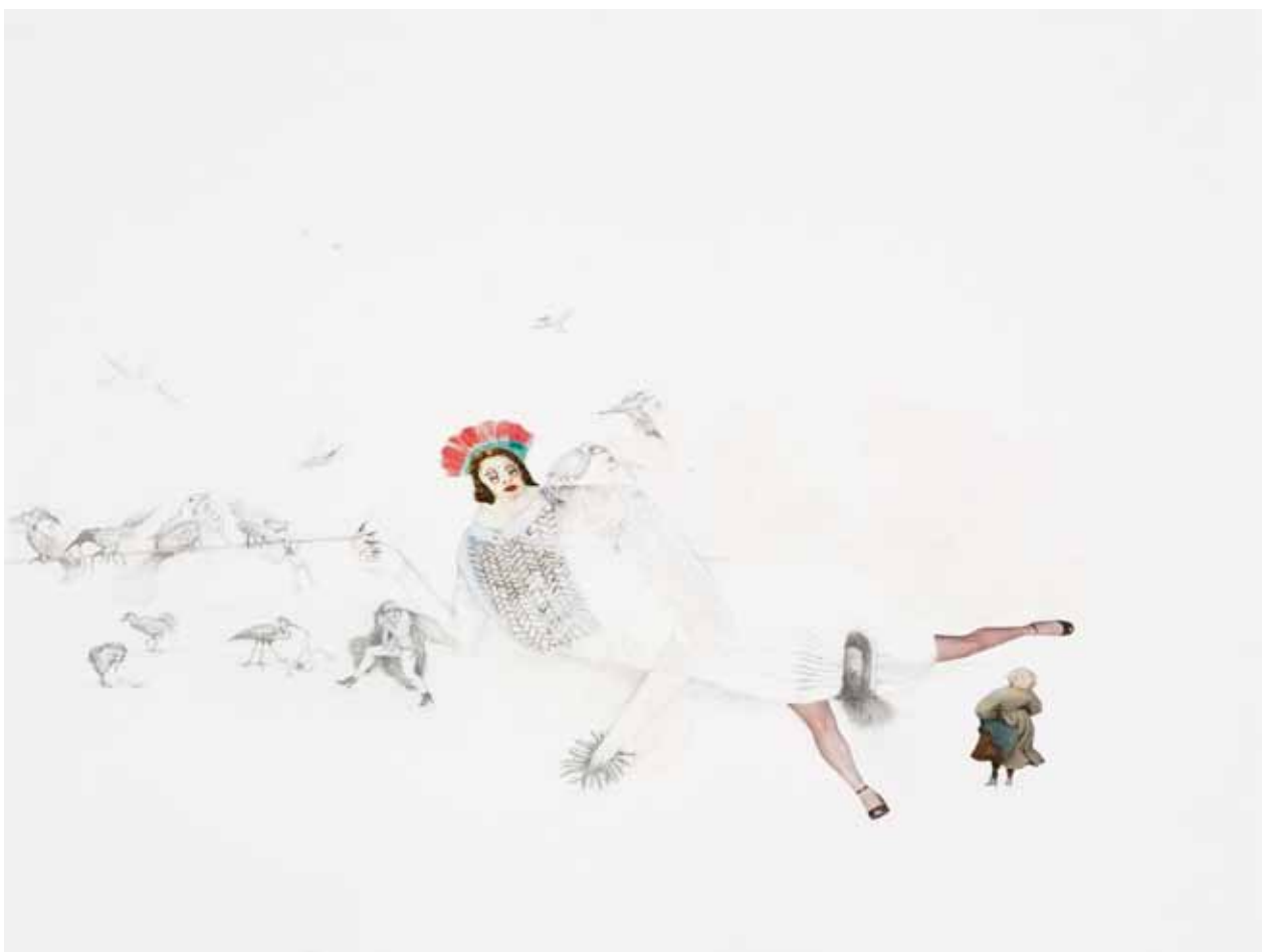
Sans titre , 2009 Karine Rougier drawing from the series Les corps endormis watercolour, pencil, ink, collage and varnish on paper 32 x 32 cm private collection