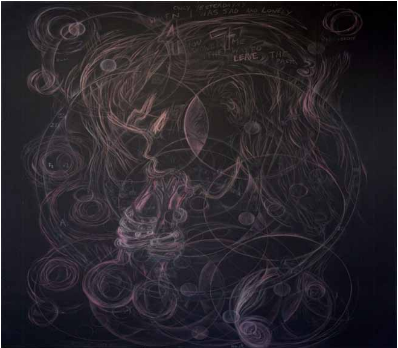
Path of Sun - Road of Life , 2008 Ellen Cantor mix techniques on paper 20 x 20 cm