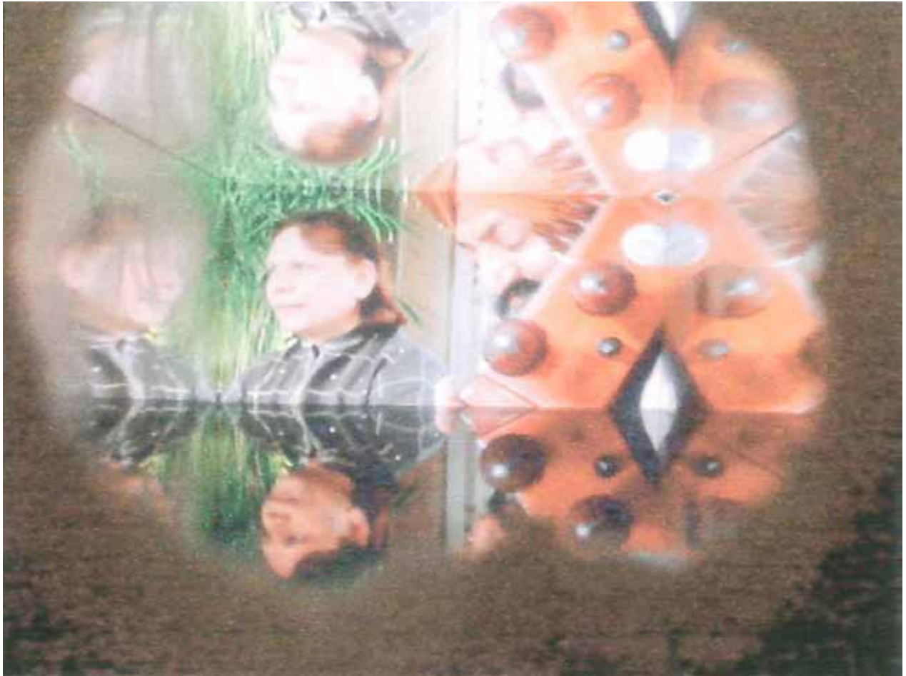
Fried Sweat , 2008 Mika Rottenberg & Marilyn Minter Video installation 2 min and photography 48,5 x 32 cm