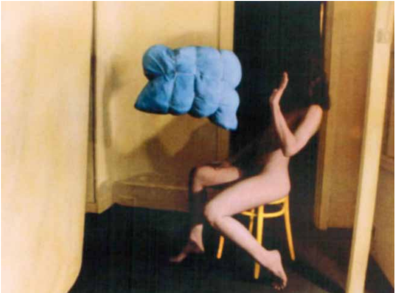
Blaue Wolke , 1979 Gloria Friedmann selfportrait color photography 70 x 60 cm