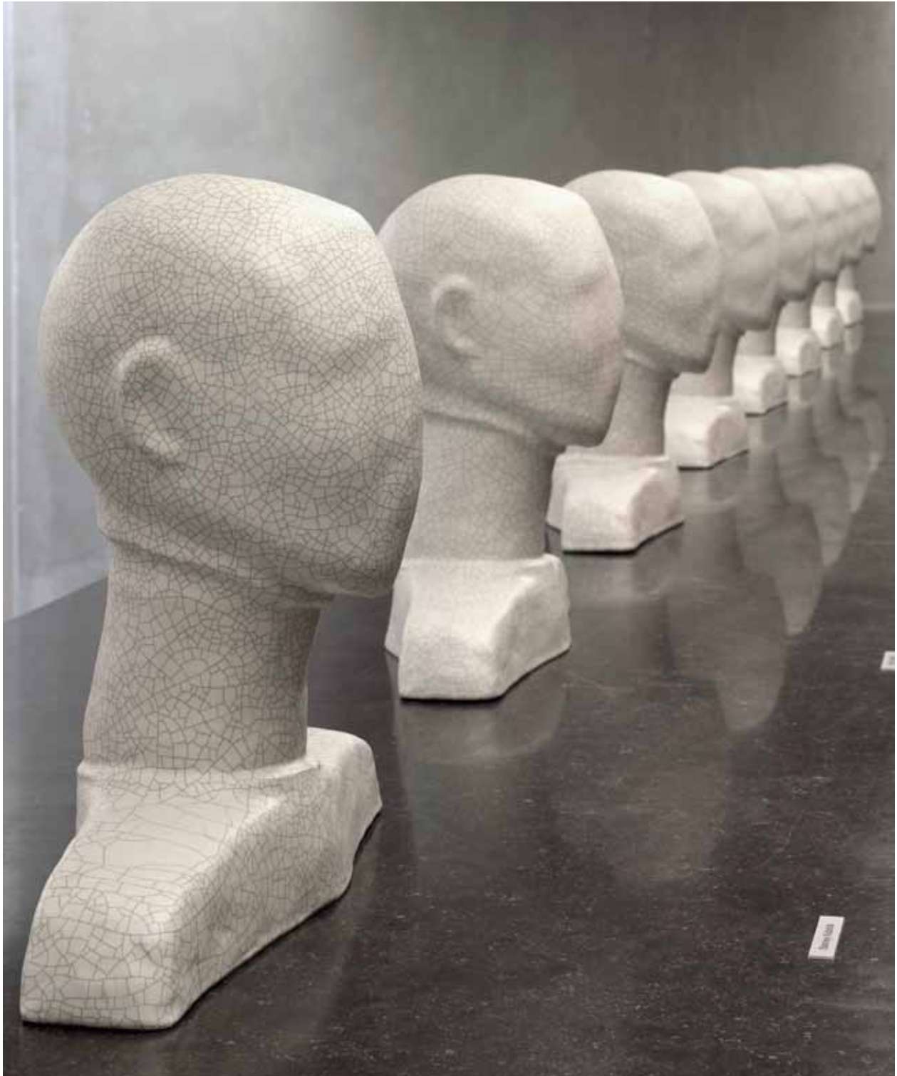
Les cosmonautes , 2008 Gloria Friedmann varnished clay