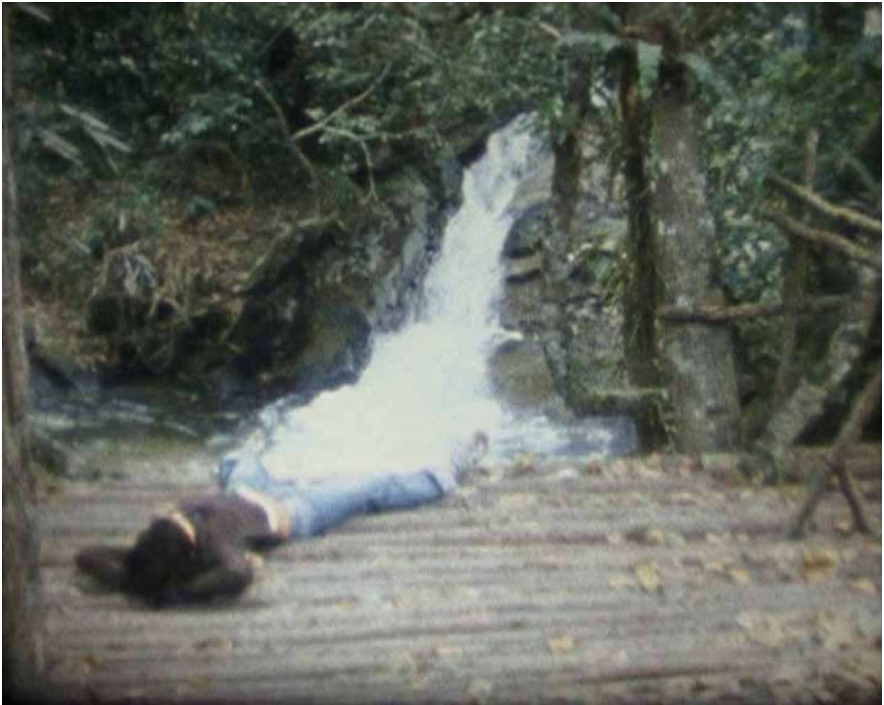
Mangousteens on milk , 2007 Salma Cheddadi super 8 transfered on dvd, 26 min