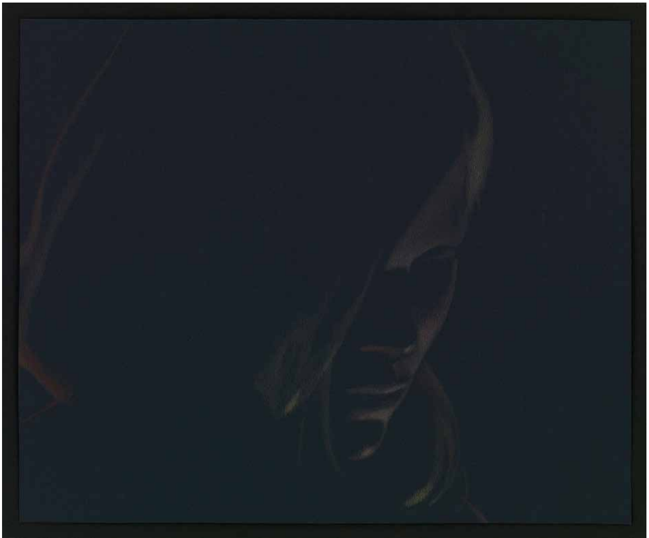
Black Mirror (Amy 2) , 2009 Series Black Mirror Monica Majoli colored pencil on black paper, frame 33,4 x 40 cm