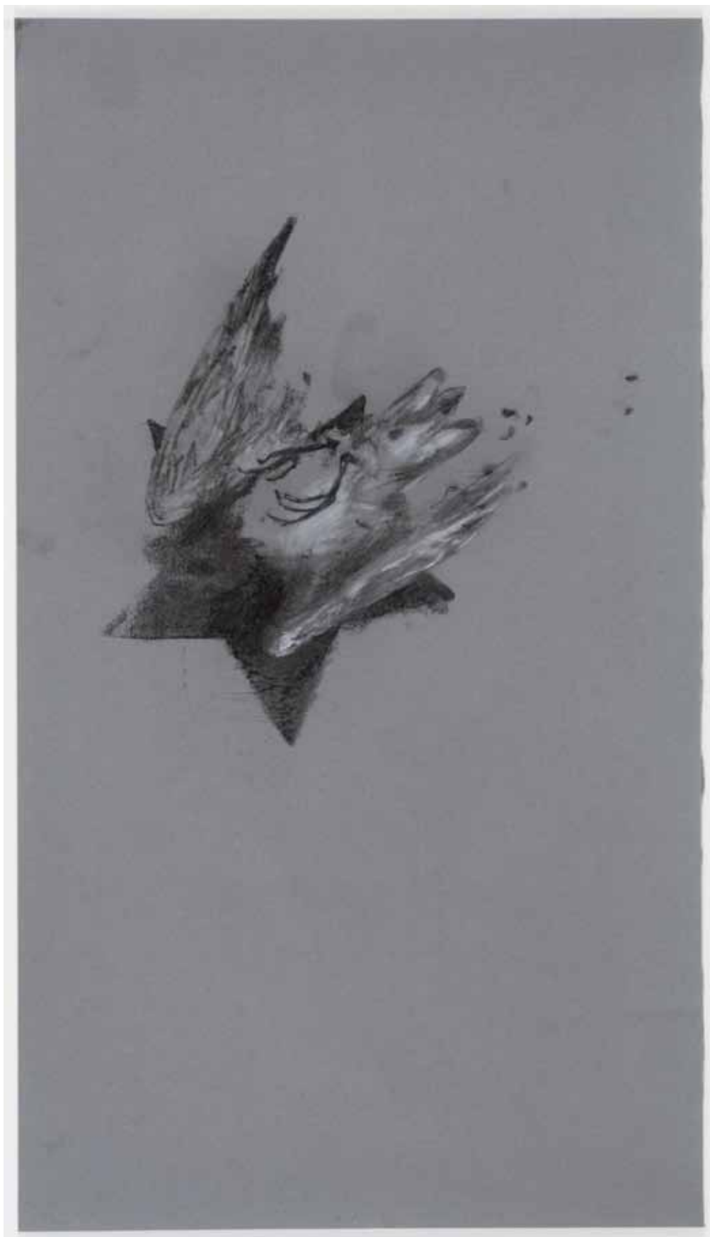
Trop de joie... 2007 Jean-Luc Verna transfer on paper heightened with pencils and pastels, wood and glass frame 70,3 x 39,5 cm, photography Marc Damage