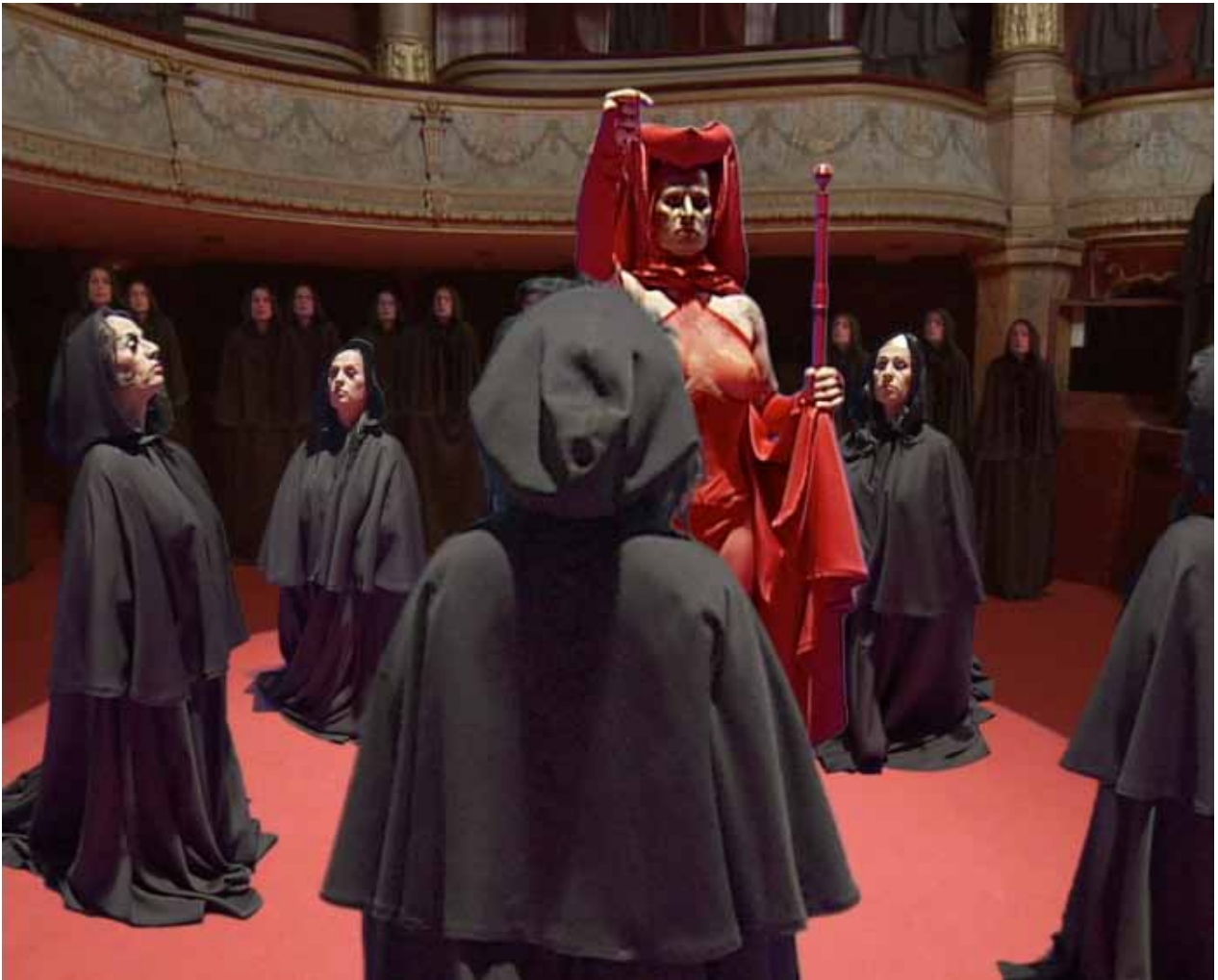
Body Double 22 , 2010 Brice Dellsperger video projection, DVC PRO50 transferred on Quicktime file and numerical Betacam 37 min, in loop courtesy Air de Paris, Paris